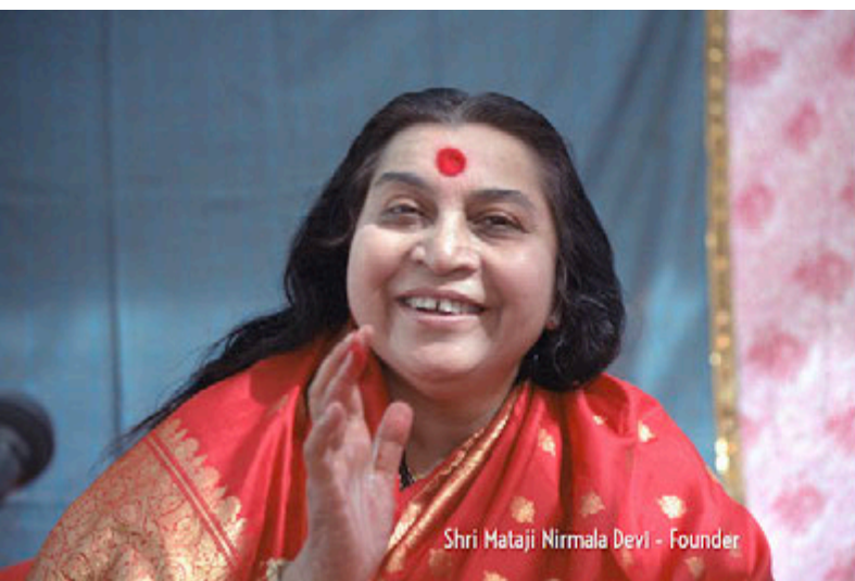
Shri Mataji Nirmala Devi - Founder