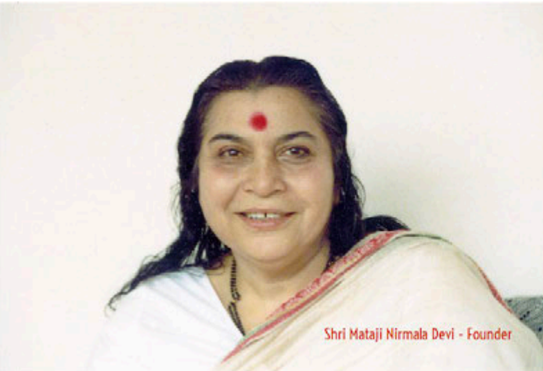
Shri Mataji Nirmala Devi - Founder