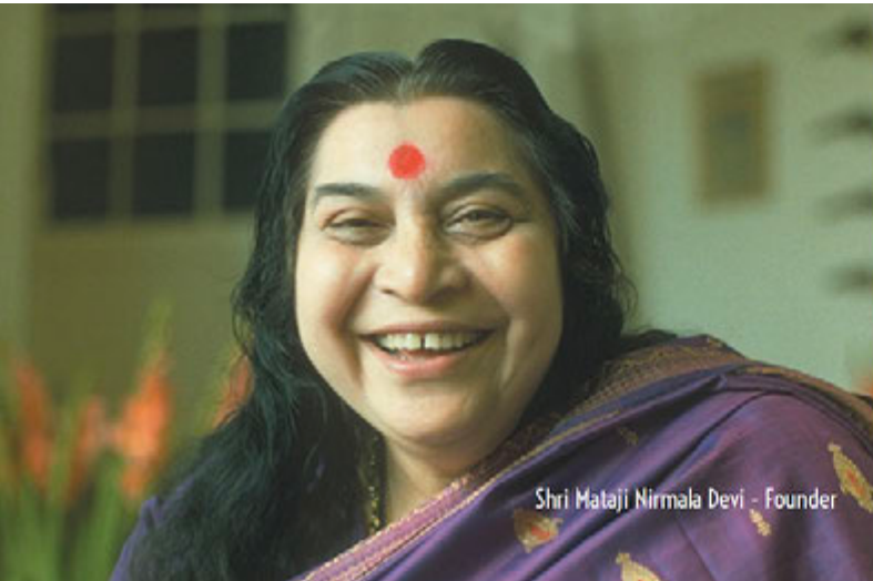
Shri Mataji Nirmala Devi - Founder