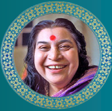
HH SHRI MATAJI NIRMALA DEVI