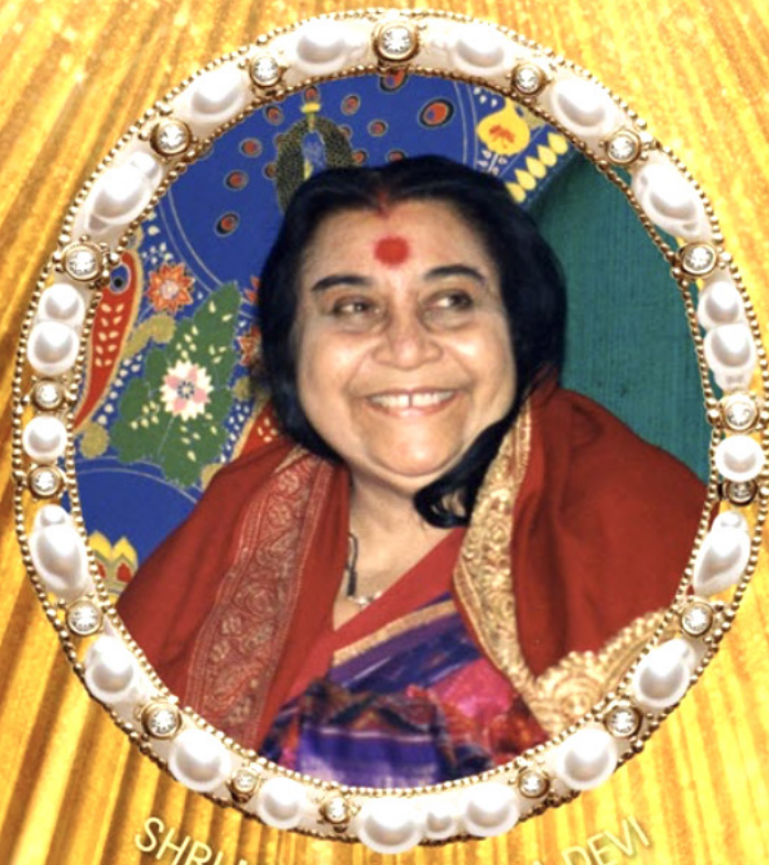
SHRI MATAJI NIRMALA DEVI