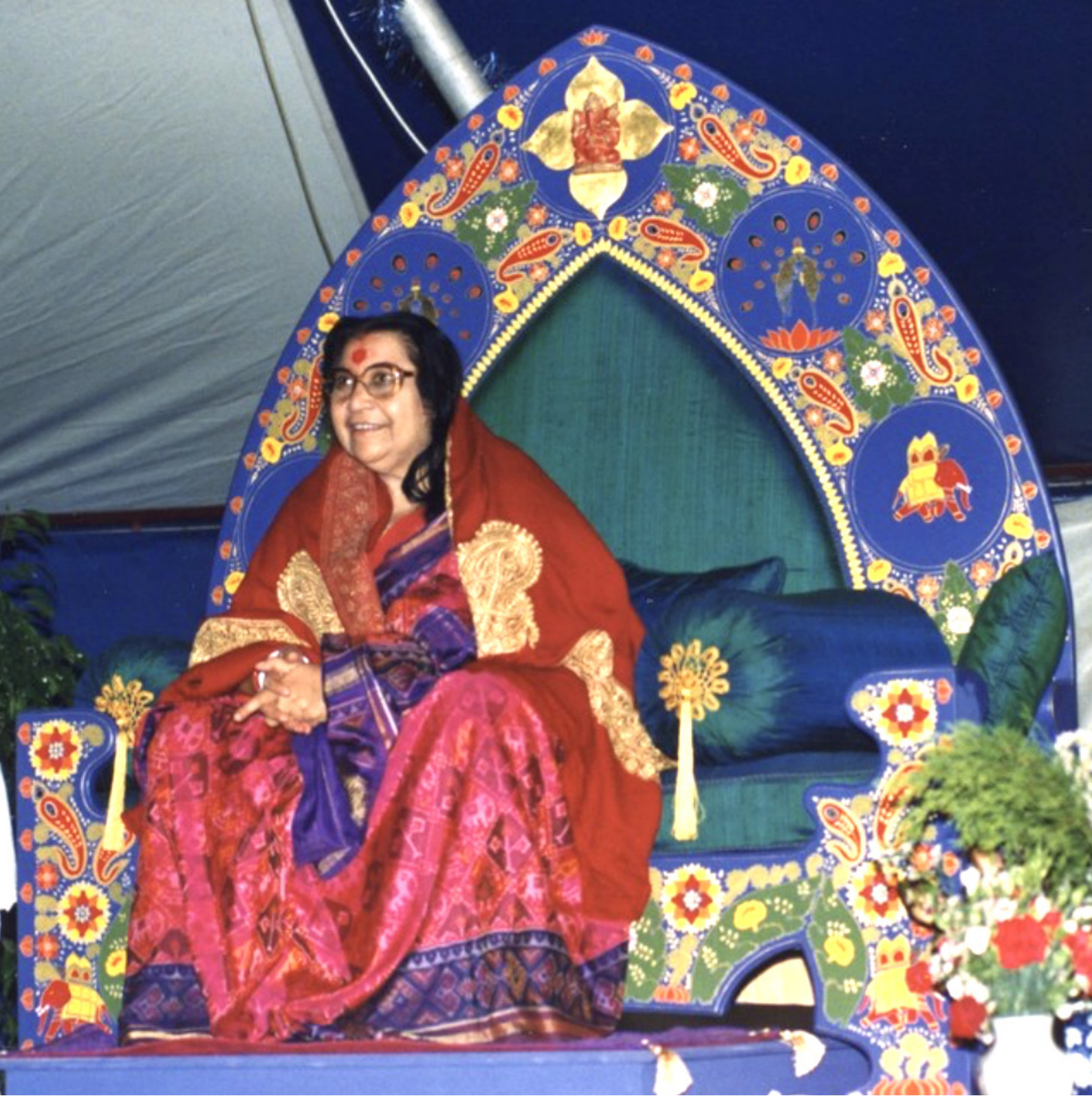
Shri Mataji – Easter Puja and Seminar Bundilla Scout Camp, near Sydney March 1991