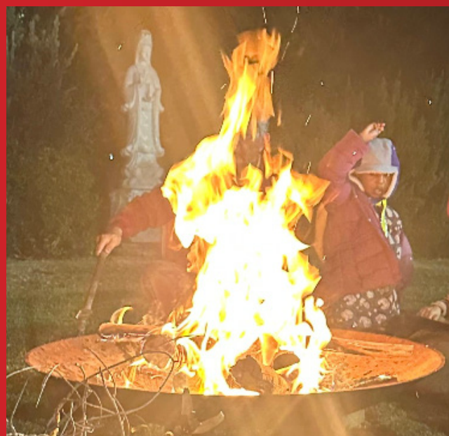
Images in the Havan Fire at Easter Puja - Bamoral - 18-5-2025