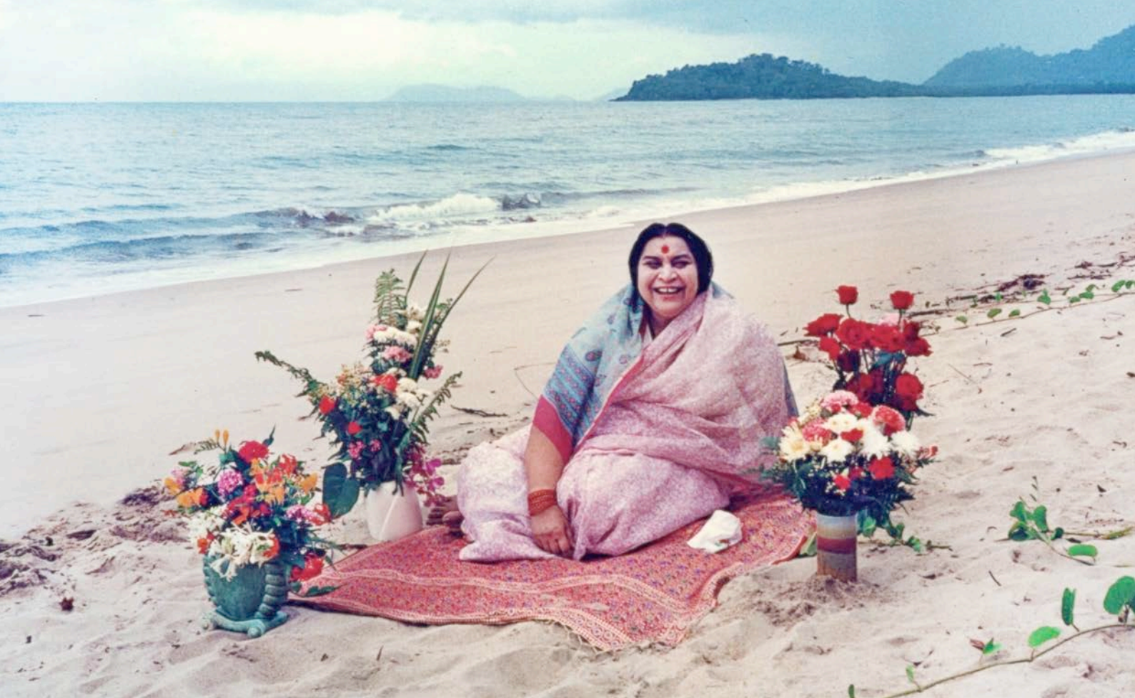
HH Shri Mataji visits Cairns and Wamuran